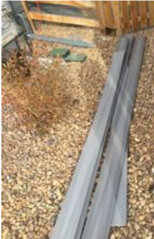
5 deck boards Grey