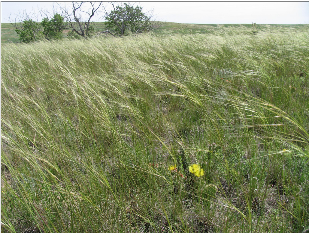
Figure 5.11 Native sand prairie with needle-and-thread grass, east of Denver.

locations are typically dominated by midgrass to tallgrass species including sandreed ( Calamovilfa longifolia ), sand bluestem ( Andropogon hallii ), Needle-and-Thread grass ( Stipa viridula aka Nasella ) and sand dropseed ( Sporobolus cryptandrus ). These species are also recommended to be included when reseeding porous landscape detention (PLD) areas, since these areas use sand enhanced growth media. Sand prairies can be planted wherever sandy soil conditions permit, however, the taller sand prairie species will be better developed on lower slopes and valley floor locations with higher levels of soil moisture.