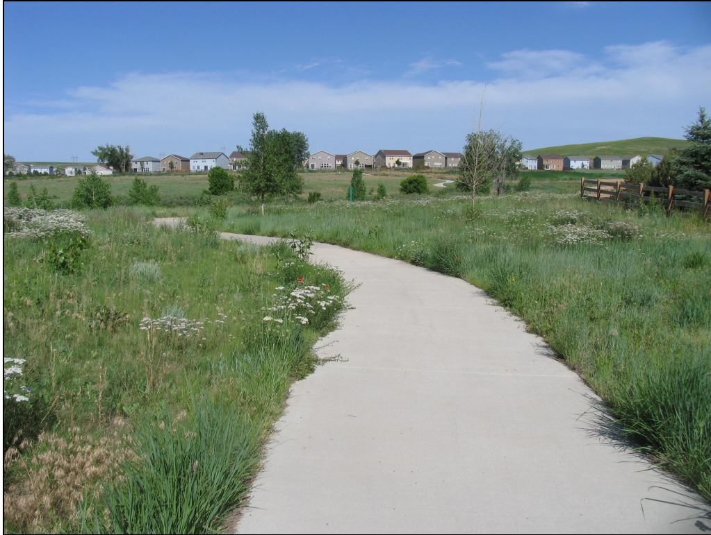
Figure 1.4 Early summer condition of mixed grass prairie planted in Erie Commons Open Space.

Native areas support passive recreation, exploration, creative play, and wildlife habitat, which greatly enrich our metropolitan areas. Personal health and well being and educational benefits can be enhanced by access to functional native or naturalized open spaces. Multi-use benefits of native restoration in drainages and riparian corridors are recognized by the recent trend in Low Impact Development (LID) designs for storm water nationwide. Such sustainable green infrastructure areas are being intentionally featured in urban designs because they provide a range of important ecological services, including: erosion protection, water quality improvement, run off reduction, oxygen production, carbon dioxide sequestration, air cooling, while serving as natural aesthetic features for passive recreation and wildlife habitat.