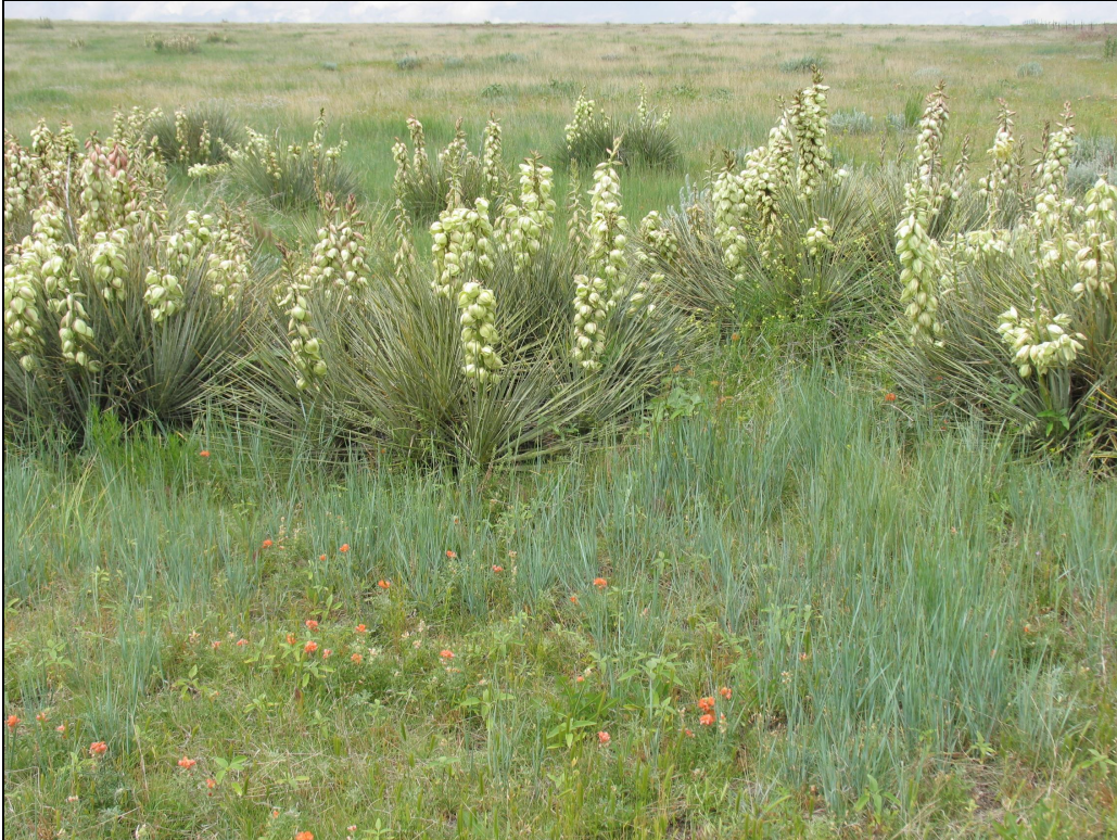
Figure 5.9 Native midgrass prairie with yucca near Aurora reservoir in late June.

community can be planted on the same range of native soils as shortgrass prairies, including clay loam, loam or sandy loam soils. Less severe areas such as east or north facing exposures, intermediate south-facing and west-facing slopes, flatter uplands sites are well suited to this grassland type.