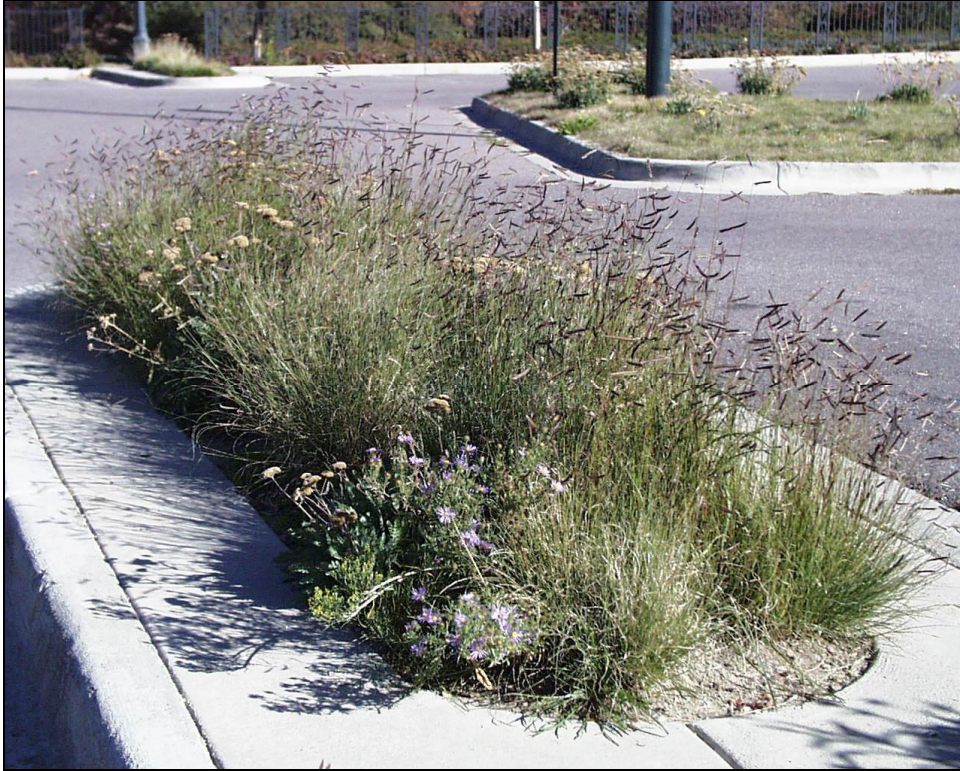
Figure 2.1 Blue grama used in parking lot islands as drought tolerant planting.