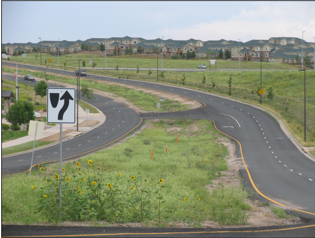
Figure 3.2 Elevated salinity levels inhibit grass cover along road edges, which leaves them more vulnerable to weediness and erosion.

winter and early spring. Drainage can be a problem in shallow soils over shale or other hard pan layers, which function as barriers to water infiltration.