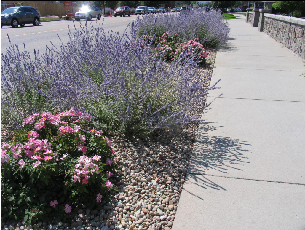
Figure 5.16 Flowering shrubs in gravel mulched beds along 28th Street in Boulder. Gravel stays in place better than wood chips along windy road edges.

readily blow away. Flower, shrub and ornamental grass beds with stone mulch can be more easily blown free of leaves and organic debris (Figures 5.16 and 5.17). There is less frequent call for fertilizer application in gravel mulched beds, since there is little decomposition.