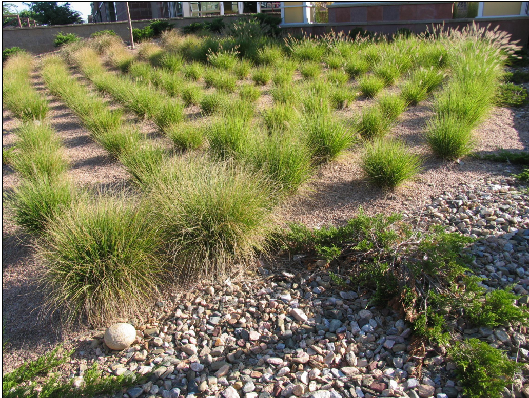
Figure 5.17 Ornamental grasses in gravel mulched bed.