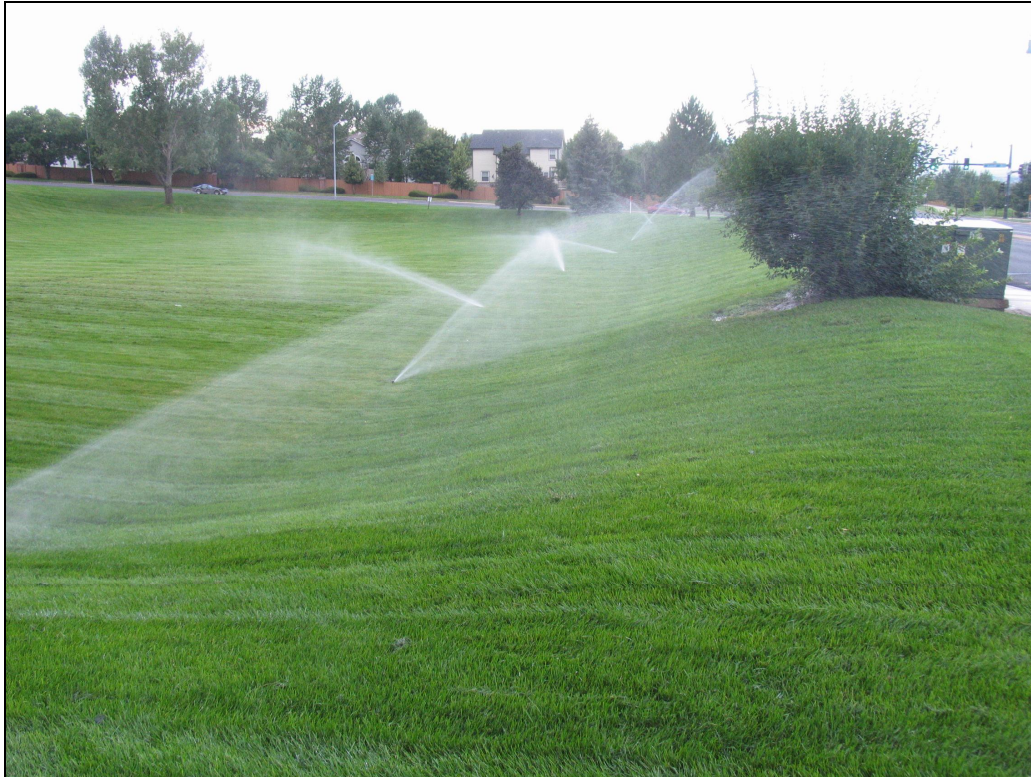
Figure 4.1 Conventionally maintained Kentucky bluegrass areas can yield close to a 20 percent water savings if placed on a modified irrigation and maintenance program.