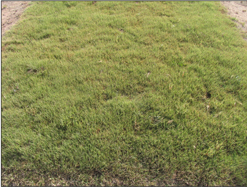
Figure 5.7 An inland saltgrass turf trial area at the CSU test plots.

with excellent turfgrass density. Unfortunately, improved varieties have not yet been commercially released from test trials.