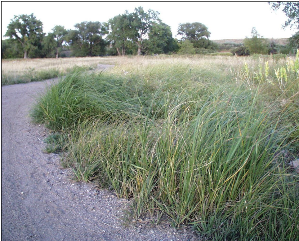
Figure 5.12 Moist meadow vegetation dominated by prairie cordgrass near South Boulder Creek.

Moist meadow and wetland vegetation is adapted to grow in occasionally or consistently saturated soils. Natural drainage areas, detention basins, seeps or low wet areas, such as