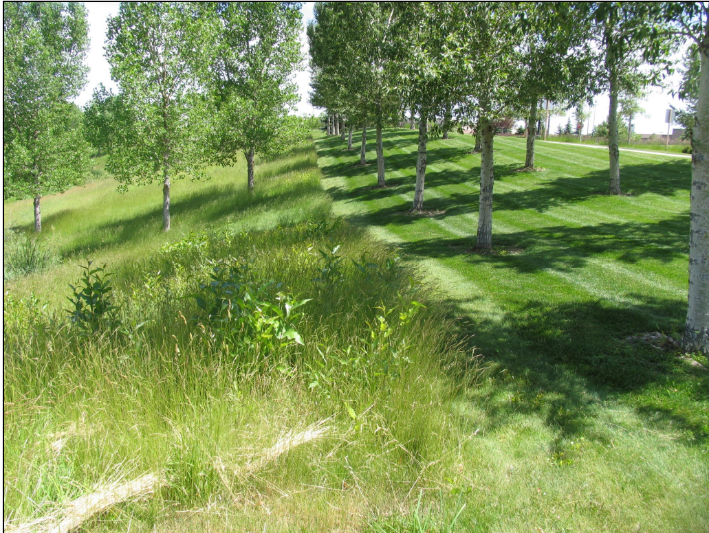
Figure 5.1 An un-mowed fine fescue grassland provides a soft cover for this shady slope. An area of mowed tall fescue turf is under the trees on the right. The lighter mowed grass just above the fine fescue slope is a mowed portion of fine fescue turf.

maintained Kentucky bluegrass. Installations of unmowed fescue grasslands can realize a 68 to 78 percent water savings. Over-watering or under-watering can result in damage, which can require overseeding for restoration. For best results, a regular irrigation schedule at reduced application rates is best to maintain an even and dense stand of grass.