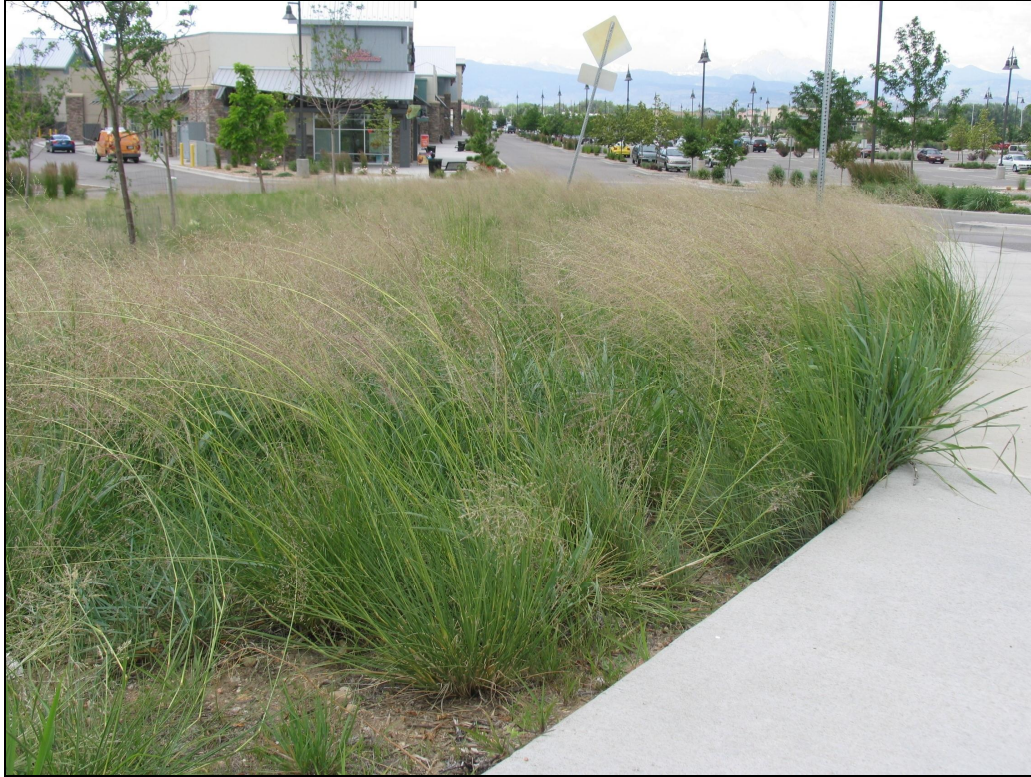
Figure 5.14 Alkali sacaton, a salt tolerant grass in roadside planting east of Longmont.