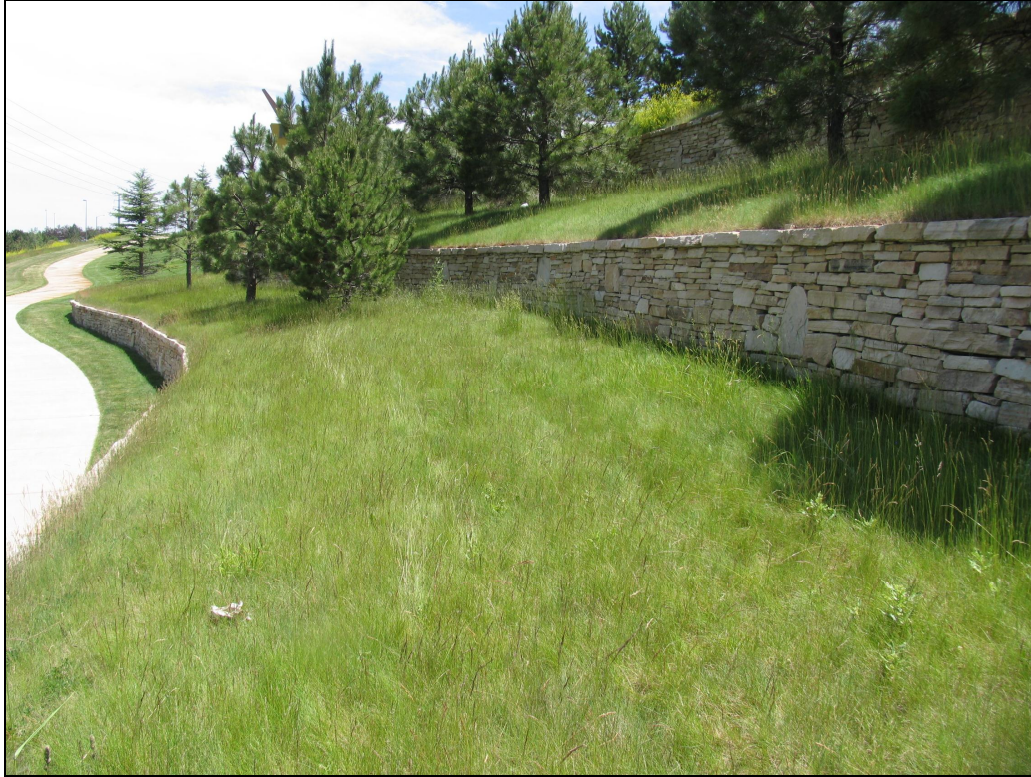
Figure 3.5 Retaining walls reduce the gradient and improve infiltration of this fine fescue grassland.