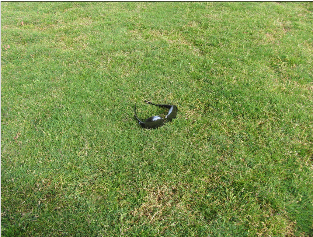
Figure 5.3 A trial area of winter hardy bermudagrass turf at the CSU test plots.

some application for turfgrass in the Front Range of Colorado. The unimproved variety, also called "common" bermudagrass is known as a weedy aggressive turf and garden invader in southern and western Colorado. The improved varieties are reported to be less invasive and are becoming more commonly used as a drought tolerant, low growing turfgrass (Figure 5.3). As with other warm season grasses, this species turns tan colored with the onset of dormancy about mid-September and greens up late in mid-May. Newer varieties have narrow (0.125 inch) deep green leaves. They are available as seed or may be propagated from plugs dug from existing stands.