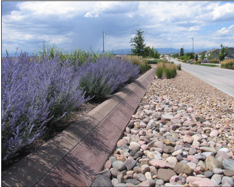
Figure 1.3 Drought tolerant median landscape along east 104th Ave in Thornton.

Sustainable landscape designs have improved greatly over the last two decades. This trend in alternative landscape creation is attuned to regional environments and driven by an interest in resource conservation. Within the Front Range corridor newer developments, malls and streetscapes have created beautiful landscapes which address the paired needs to reduce water consumption and maintenance efforts (Figures 1.1, 1.2 and 1.3). This forward-looking trend has already found wide application, offering a diverse and attractive regional setting for newer urban and suburban developments.