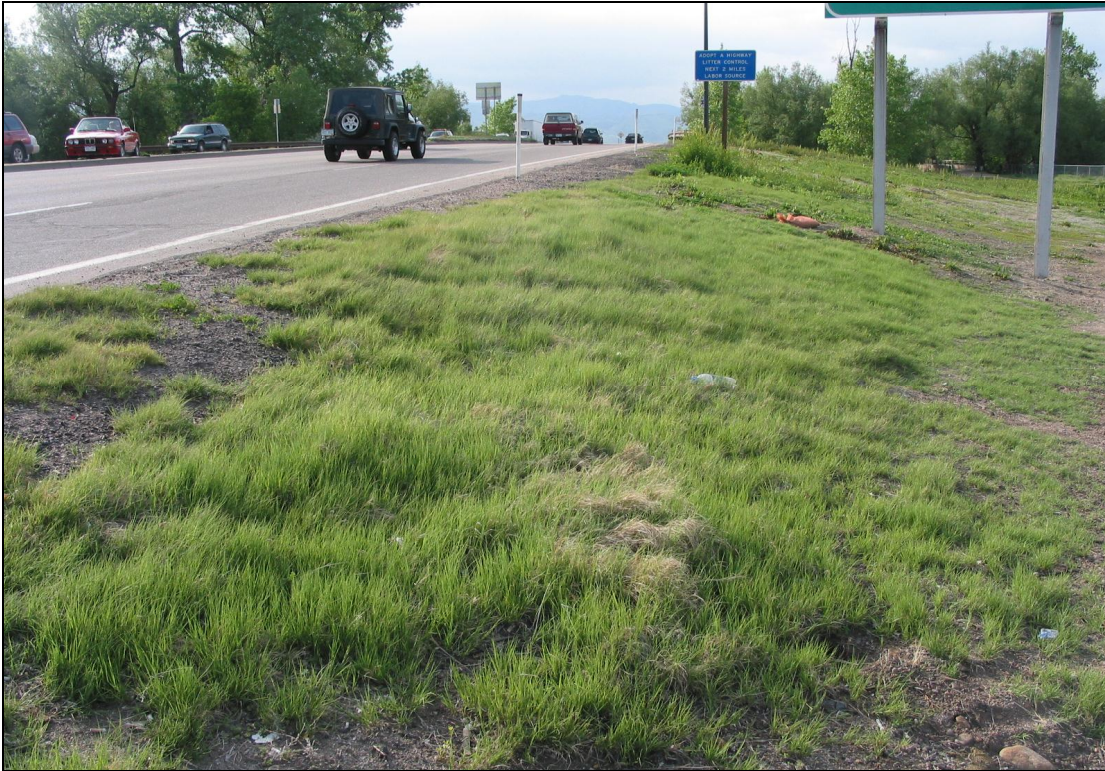
Figure 5.13 Native inland saltgrass on roadside in north Boulder.

Elevated salt levels naturally occur in the Denver area, due to exposed regional marine sediments. The splash zone in roadside areas can also have elevated salt content where salt products are used for de-icing. If a grassland or native prairie mixture has been planted within a streetscape, a salt tolerant mixture can be over-seeded on top of the basic seed mixture to provide salt tolerant grasses (Figures 5.13 and 5.14). However, all native species have an upper limit of salt tolerance. Mature salt tolerant species can tolerate twice the levels (EC of 6-8 mmhos/cm) necessary for their seedlings to successfully establish (EC of 3-4 mmhos/cm). The edges of highways, where magnesium chloride is regularly applied, may already exceed the acceptable salinity levels tolerated by these native species. It can be very difficult to keep vegetation alive in these areas. If roadside areas have an irrigation system, it can be helpful to thoroughly irrigate in early spring in order to flush the salts from the soil.