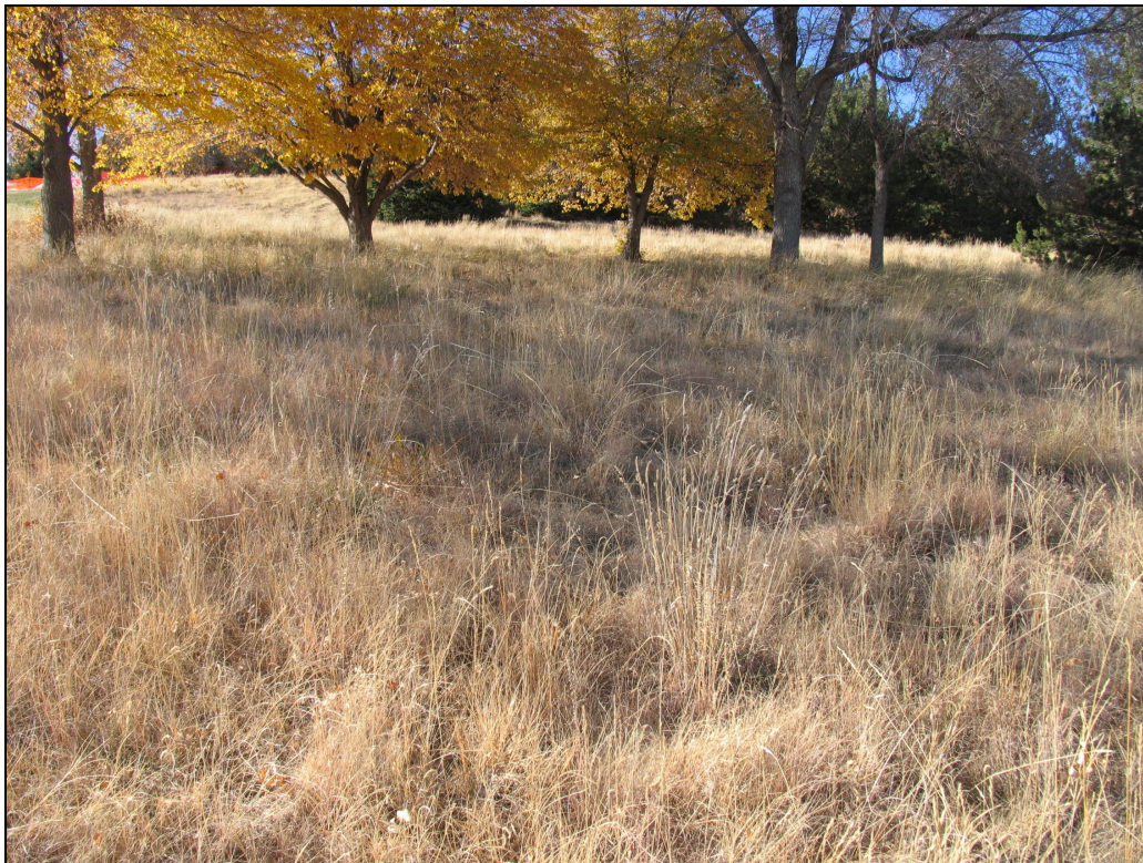
Figure 9.1 Midgrass prairie conversion area in fall condition on Ruby Hill, Denver.

Water demands from on going population growth along the Front Range will continue to apply heavy pressure to the available water supply. At this time, most turfgrass areas remain as water consumptive conventional Kentucky bluegrass. Up to this time drought tolerant landscape designs have focused largely on installation of mulched beds with drip systems, and grasslands. Conversion methods need to be more widely demonstrated on public landscapes (Figure 9.1). While buffalograss and blue grama have seen some use as alternative lawns, excellent alternative turfgrasses such as cold hardy bermudagrass and inland saltgrass have seen very limited application. They should receive more visible application in the public landscape. Modified irrigation and maintenance programs for Kentucky bluegrass should also be publicly demonstrated (Section 4).