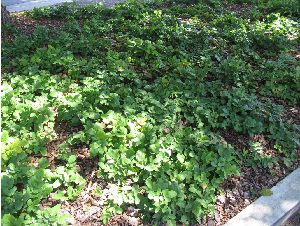
Figure 5.15 Native Oregon grape in shady woodchip mulched bed under pines.

for traditional turf, depending upon the selected vegetation. Conversion turfgrass or native grassland conversions which have pre-existing tree or shrubs can preserve the shrubs and trees by installing mulched beds around the woody plantings. The beds should extend to the tree or shrub drip line (outer extent of the tree or shrub canopy). Separate irrigation must be provided for the mulched beds and adjacent grass areas.