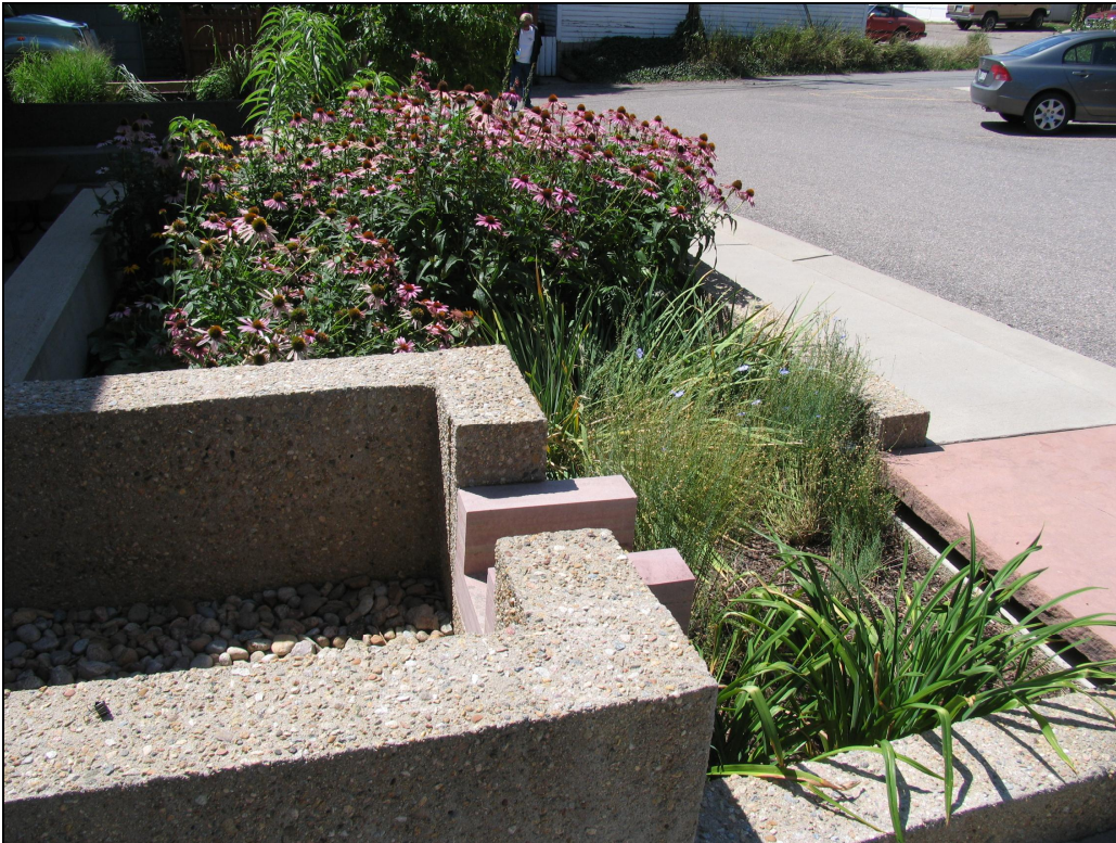
Figure 3.6 A colorful rain garden which receives roof runoff and is supplemented by a drip irrigation system during dry spells.

Drainage areas can often be converted to include riparian plant communities. With no additional water, low areas can support diverse local native vegetation including: tallgrass prairies, moist meadows, and wetlands. Where space allows, native woody species can be added to improve community structure and habitat value, including plains cottonwood, peach-leaved willow, wild plum, chokecherry, golden currant, red osier dogwood, woodbine, netleaf hackberry, virgins bower, western snowberry and other attractive species. Planted in the proper locations for the individual species' soil moisture requirements, these native plants need little or no irrigation after establishment. These riparian species can provide erosion protection, summer cooling, structural and aesthetic diversity as well as critical wildlife habitat.