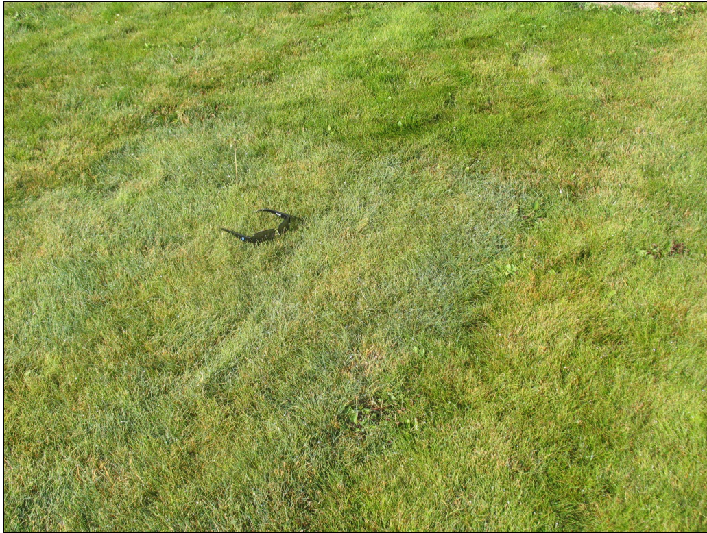
Figure 5.2 Several varieties of fine fescue turfgrass at the CSU turfgrass test plots show the variations in color which are possible within a fescue mixture.

irrigated, fine fescue areas can thin and become patchy. If weed control is required, always check labels prior to chemical application, fine fescues can be sensitive to some herbicides.