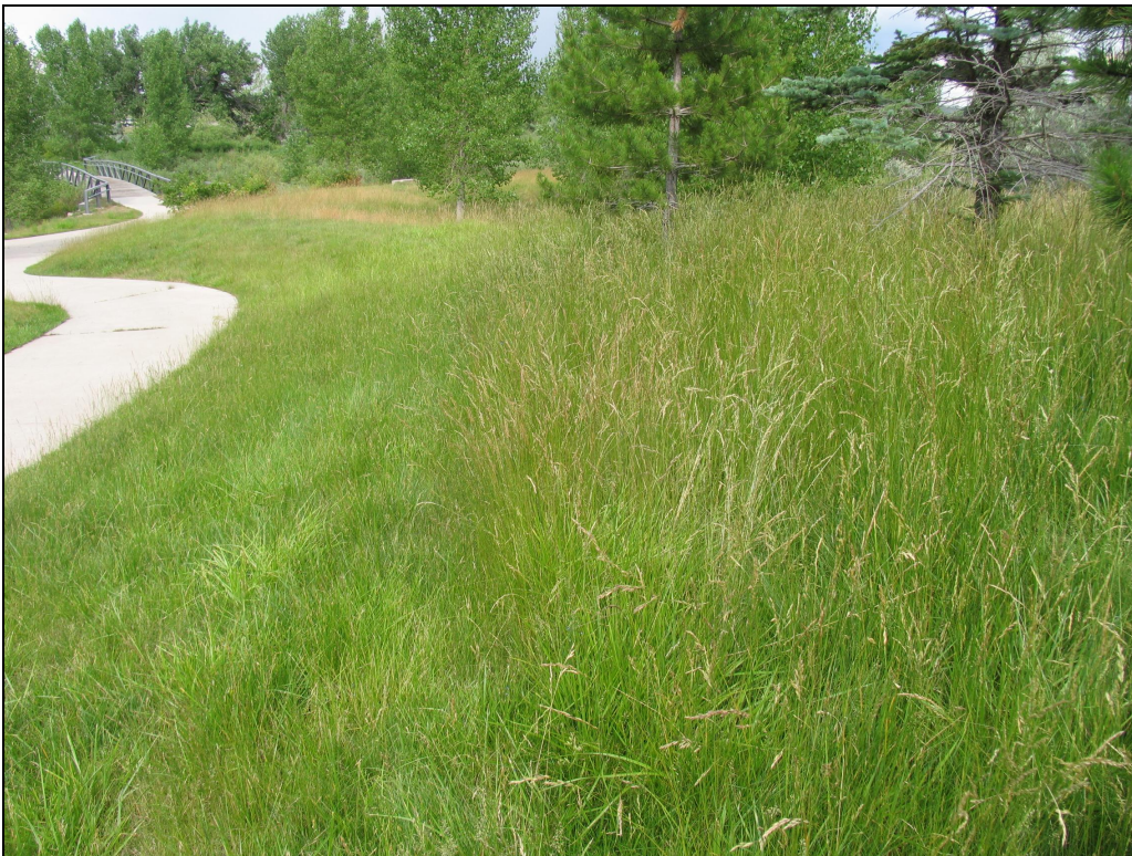
Figure 1.2 Mowed and unmowed fine leaved fescues can provide water savings of 40 percent or greater. This installation is located at Flatirons Crossings Mall in Broomfield.