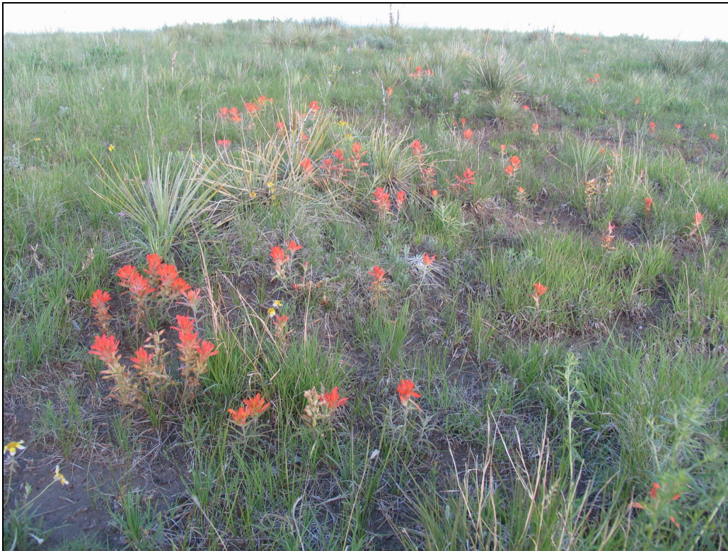
Figure 5.8 Native shortgrass prairie east of Denver in late June with yucca and orange flowering Indian paintbrush.

Shortgrass prairie species occur widely in native areas east of the Front Range. This grassland type is very drought tolerant. Sunny exposed locations can support this low