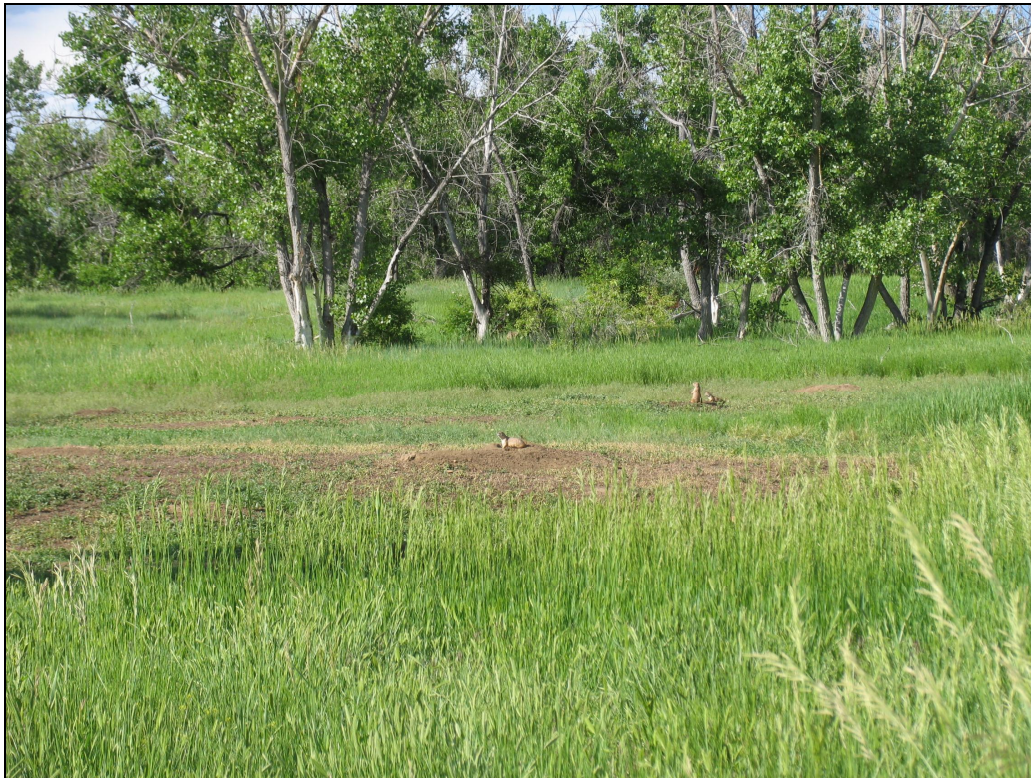
Figure 7.1 Prairie dogs require large areas of grassland and careful management to prevent overcrowding and degradation of the landscape.

It is essential that any newly seeded areas near existing prairie dog colonies be monitored. Encroaching prairie dogs should be controlled or removed immediately to prevent costly reseeding. Several years of grazing exclusion are essential to allow for good root development. Heavy grazing will eventually degrade conversion sites.