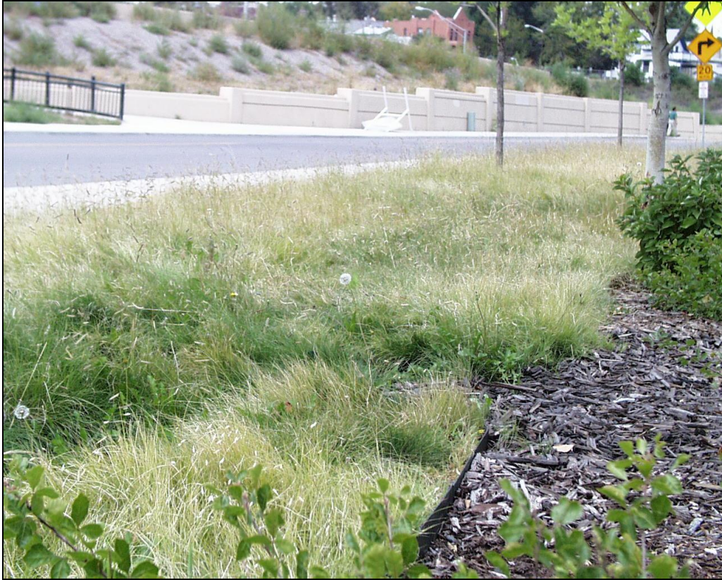
Figure 5.6 Blue grama turf with flowering heads near REI, in Denver. This area is a bit too shady; fine fescues might be better.

broadleaf or broad spectrum herbicides can be safe during the late dormancy period in March or early April, prior to warm season green up in May.