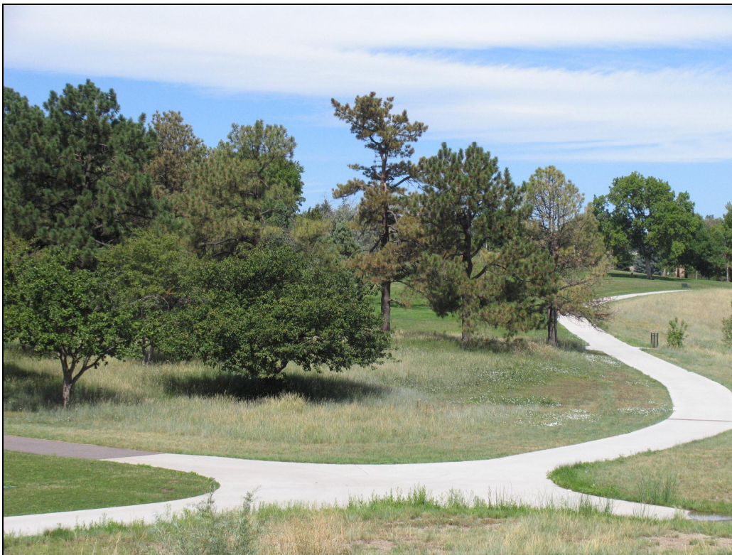
Figure 5.4 A new wheatgrass installation late in the first year after seeding. This installation shows the late summer appearance of the unmowed wheatgrass grassland. A six foot band of mowed wheatgrass turf appears in the lower left photo adjacent to the sidewalk. A small section bluegrass lawn appears on the left and at the top of the photo. The thin spots filled in the following year.

throughout the Front Range of Colorado. It is useful in mowed tree lawns or parking strips where a coarser (wider) leaf texture is acceptable. This mixture of species can provide a very durable drought tolerant turf which requires less maintenance than conventional Kentucky bluegrass. It includes both native and introduced cool season wheatgrasses with moderately good turf potential. Unmowed grasslands can germinate and establish fairly easily on 15 inches of precipitation or irrigation per year. Establishment irrigation will improve seeding results. If not mowed the seed heads can reach 24 inches in height and are interesting but not striking. Except for slender wheatgrass, these grass species are sod formers. This cool season mixture of grasses will grow well in clay loam to loam soils. Two different seeding rates are included in Appendix A: one for turf, at a heavier seeding rate, and one for naturalized grasslands, at a lower seeding rate.