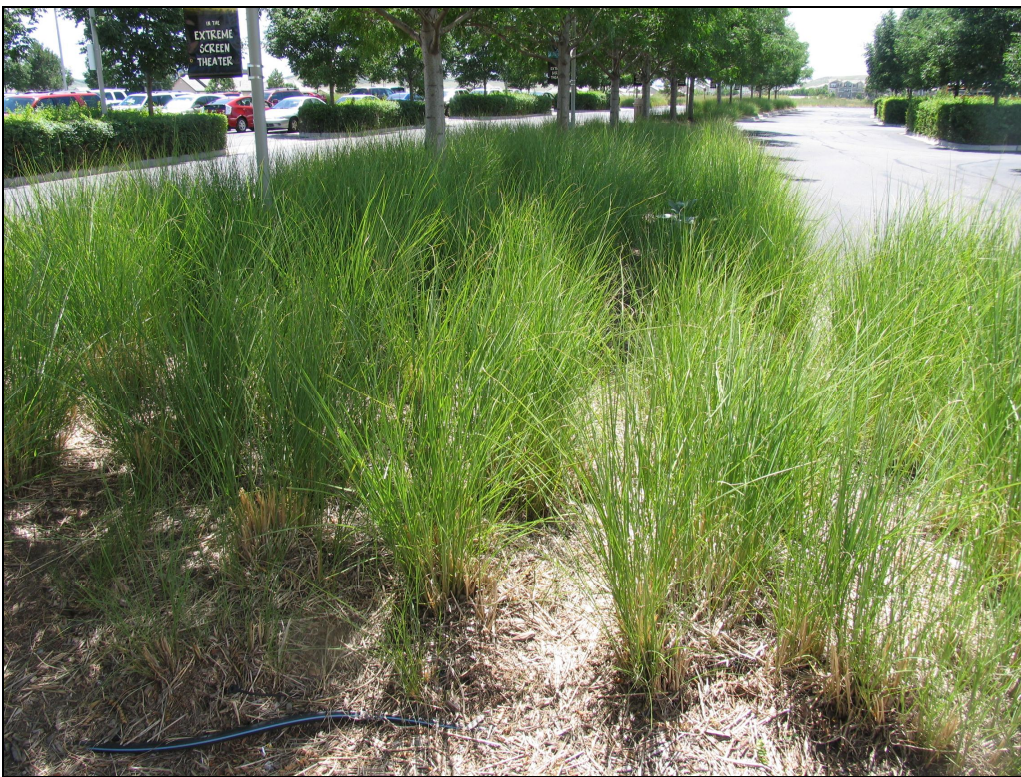
Figure 3.4 Mulched ornamental grass bed in tree lawn. Note use of drip irrigation line in foreground.

Stands of warm season conversion turfgrass species may thin in shaded areas due to a lack of direct sunshine and competition with existing tree or shrub roots. Heavily shaded areas can be converted to mulched beds. For the best water savings and improved woody vegetation maintenance, the irrigation for mulched tree and ornamental grass or shrub beds should be separate from grass areas. Separate zones permit optimal irrigation programs for shady locations and adjacent sunny exposures, or for vegetation types with differing irrigation requirements (Figure 3.4).