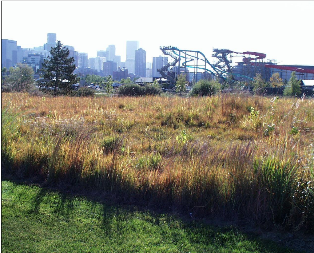
Figure 5.10 A seeded tall grass prairie in Fishback Landing Park west of downtown Denver showing fall color in late September.