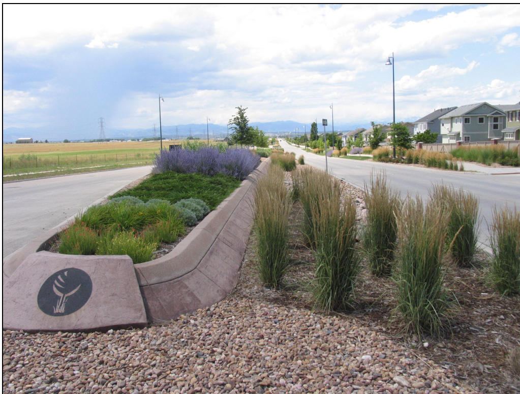
Figure 3.3 Splash guards and vegetated elevated medians can help reduce salt impact to plantings along road edges.

Where healthy streetscape vegetation is critical, physical protection for vegetated medians and street edges can be enhanced with elevated medians which provide splash guards to reduce damage from salt spray (Figure 3.3). To create a successful streetscape, it may be necessary to leach accumulated salts or replace existing saline soils with fresh topsoil. By installing an irrigation system, heavy winter salt contamination can be flushed from the area each spring. Saline street areas or roadsides, where installation of irrigation flushing systems would be impractical, should be considered for hardscape treatment.