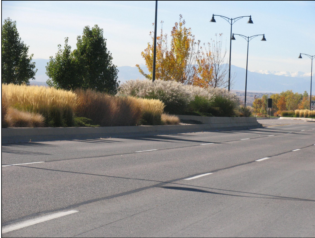
Figure 1.1 Attractive use of drought tolerant ornamental grasses in a Front Range streetscape.