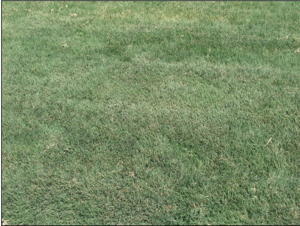
Figure 5.5 Legacy variety buffalograss turf display in July, shows a rich medium green color.

cool season grasses is essential. Careful application of broadleaf or broad spectrum herbicides may be safe during the late dormancy period in March, prior to warm season green up in May. Always follow herbicide label directions.