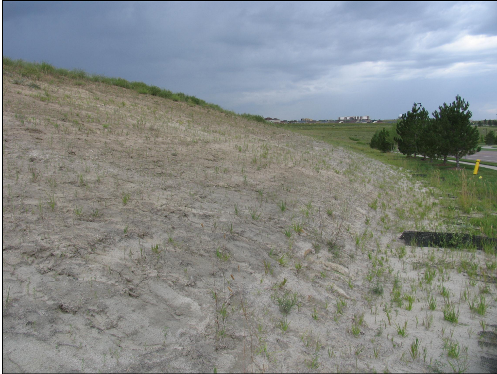
Figure 3.1 Vegetation has not successfully established in this area of exposed subsoil. Salvage and reapplication of topsoil would have improved seeding results.