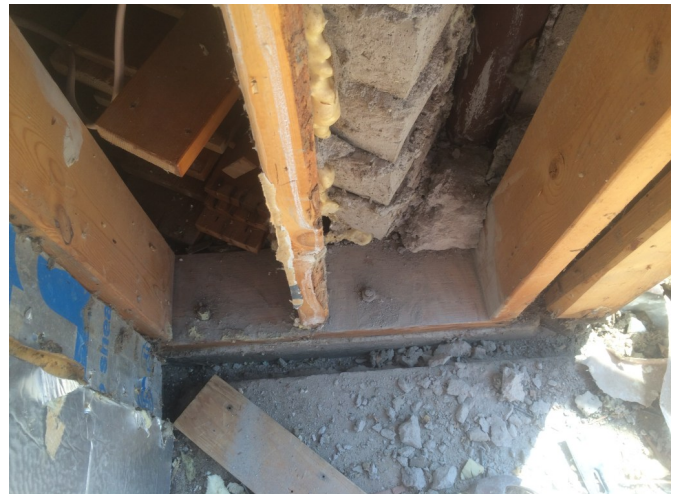
Insulated wall at ends