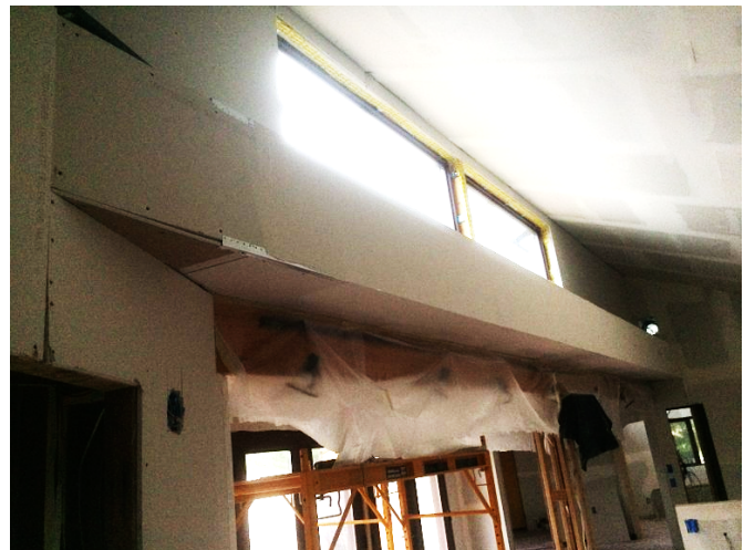
Light shelf under clerestory windows

All the lights in the house have been converted to LED fixtures or bulbs to help save power and provide the best LED color rendering performance.