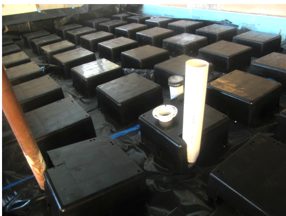
Radon vent installed under concrete

Designed two 30' concentric circles around radon exhaust pipes to cover the slab square footage. The former crawlspace passive exhaust is now powered by a radon fan.