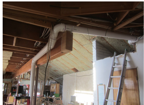
Radon vented to outdoor fan