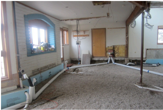
Water pipe layout under floor

The structured plumbing system for our house is too long for LEED points but it is