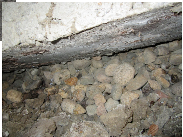
Gap under concrete walls